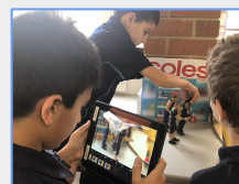
2018 Creative Arts Term 4 Filming

See the latest photos on the school website: