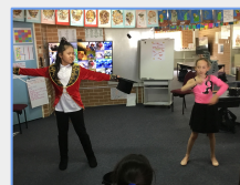
2018 Busking for Mission