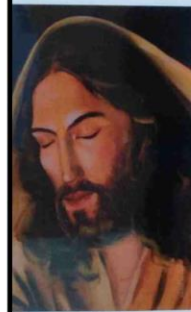
Agony in the Garden